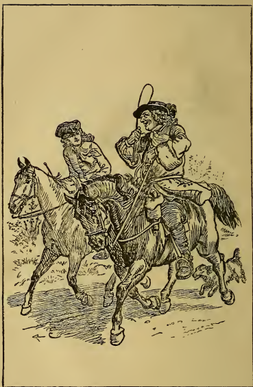
THE TORY FOXHUNTER